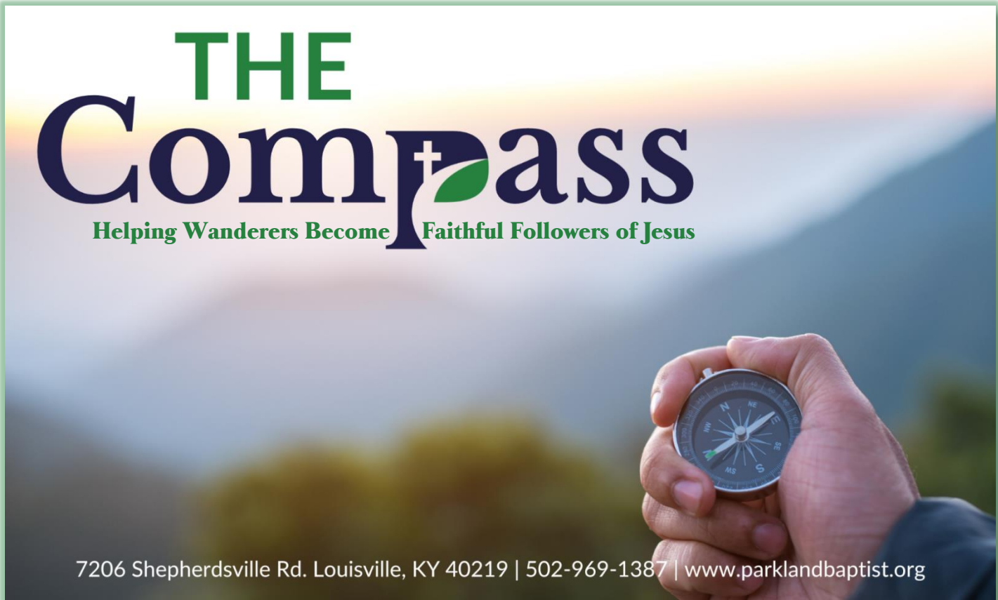
May 2025 Edition

March 2025 Financials for Parkland Baptist Church March Income: $77,907 March Expenses: $58,065