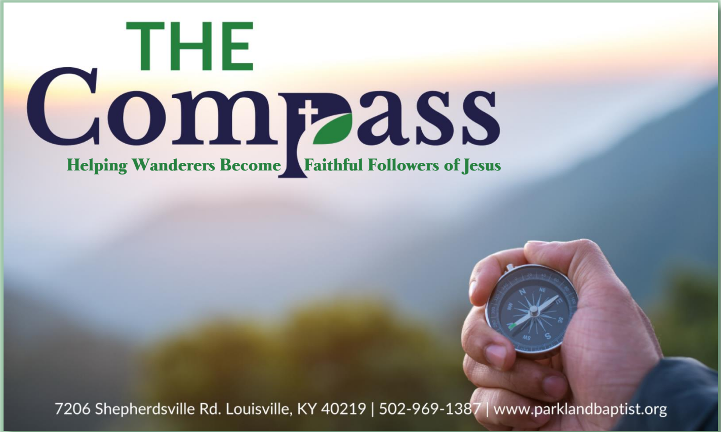
June 2025 Edition

April 2025 Financials for Parkland Baptist Church April Income: $63,758 April Expenses: $63,824